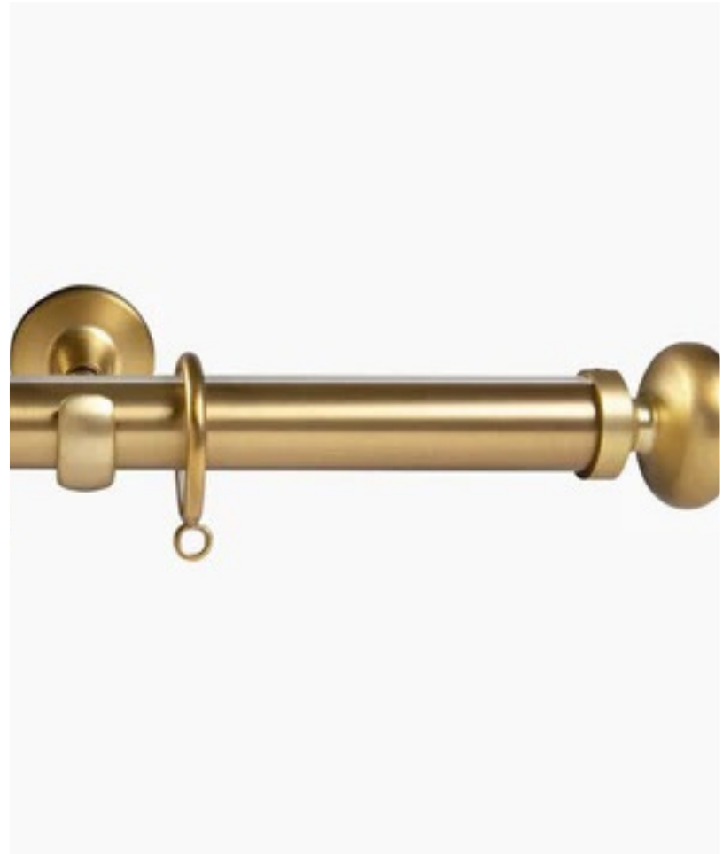
Rod with Rings